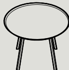
TLD-21-600 Ø600 H410 Ø23.6" H16.1"